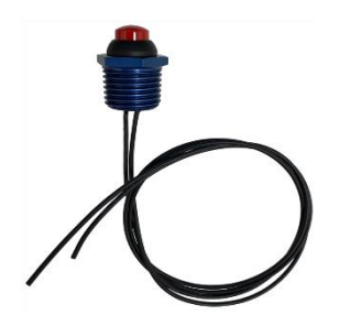
Shown Above: External Reset Switch, Included