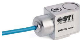
CMCP422VTS Side Entry