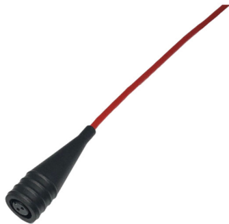
CMCP602HST Push On IP68 Connector