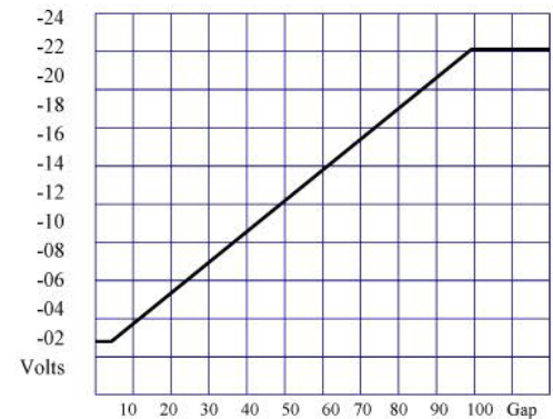
Eddy Probe Graph

The CMCP610 is provided with a USB thumb drive which includes a field calibration reporting tool for use with Microsoft Excel.