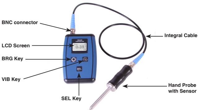
Figure 1. The VBA20