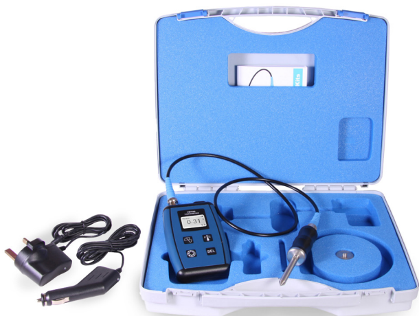
CMCP-620VT in case