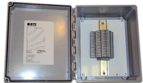
Shown Above: CMCP265HD-FG-16 High Density Fiberglass Junction Box, 16 Channels