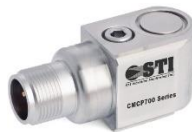
CMCP422VTS-XX-X-C 2 Pin MS 5015 Connector