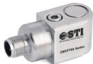
CMCP422VTS-XX-X-M12 M12 Eurofast Connector