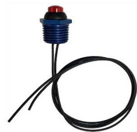
Shown Above: External Reset Switch, Included