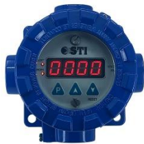
CMCP-DVS-EX Digital Vibration Switch for Hazardous Locations