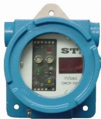
CMCP1000 Dual Limit Single Channel Vibration Switch