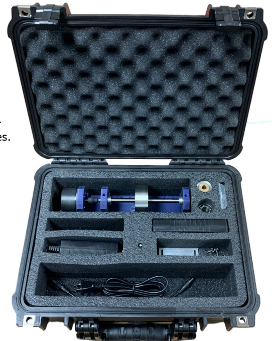
CMCP601M Shown in Travel Case