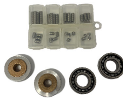
Balance Weight Kit and Bearing Modules