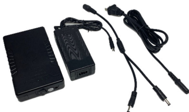
Battery, Charger and Cables