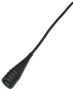
CMCP602LST Series 2 Socket Push On