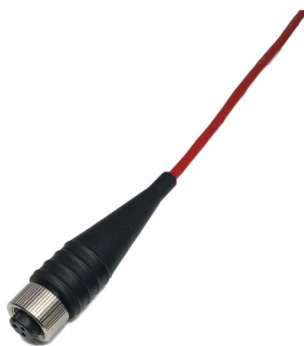
CMCP602H 2 Socket Locking Collar