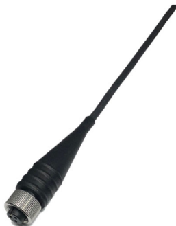
CMCP603L 3 Socket Locking Collar